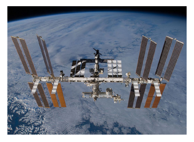
The International Space Station in November 2009 seen from the Space Shuttle Atlantis.