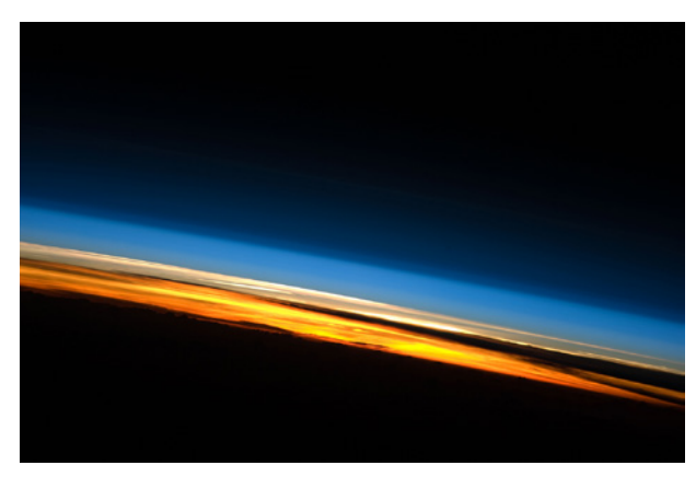
Sunset over the Indian Ocean from the International Space Station (ISS). Taken by a member of Expedition 23 in May 2010. Image: NASA

which point you'll literally see jaws drop as they realize that they are about to give you an answer that directly contradicts the one they gave you a few seconds before. In other words, most people know that gravity keeps Earth orbiting the Sun and the Moon orbiting Earth, which clearly means that there is gravity in space. In fact, simple calculations show that the strength of Earth's gravity in low-Earth orbit (where the movie Gravity takes place) is only about 10% less than the strength