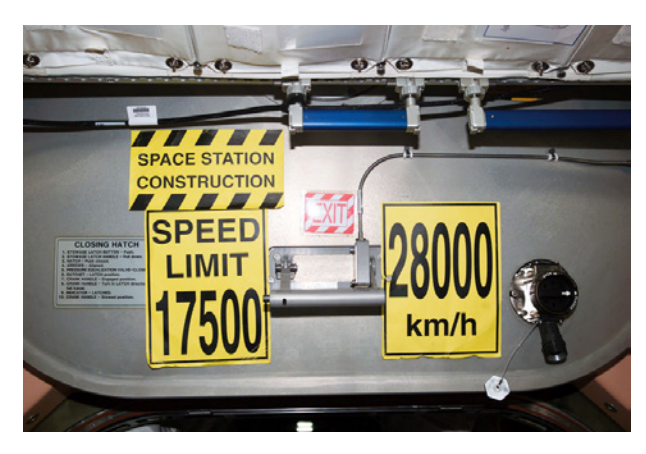
A close-up view of "speed limit" parody signs on a space station hatchway photographed in 2006 by an Expedition 12 crewmember. The speeds cited — in both English and metric measurements — are equivalent to the station's velocity, keeping it in orbit.

Gravity is always present in space and always pulling everything in Earth orbit toward the ground, including the Shuttle, the Hubble Space Telescope, the International Space Station, and the astronauts. The only reason these objects don't quickly crash to Earth is that they are also mov-